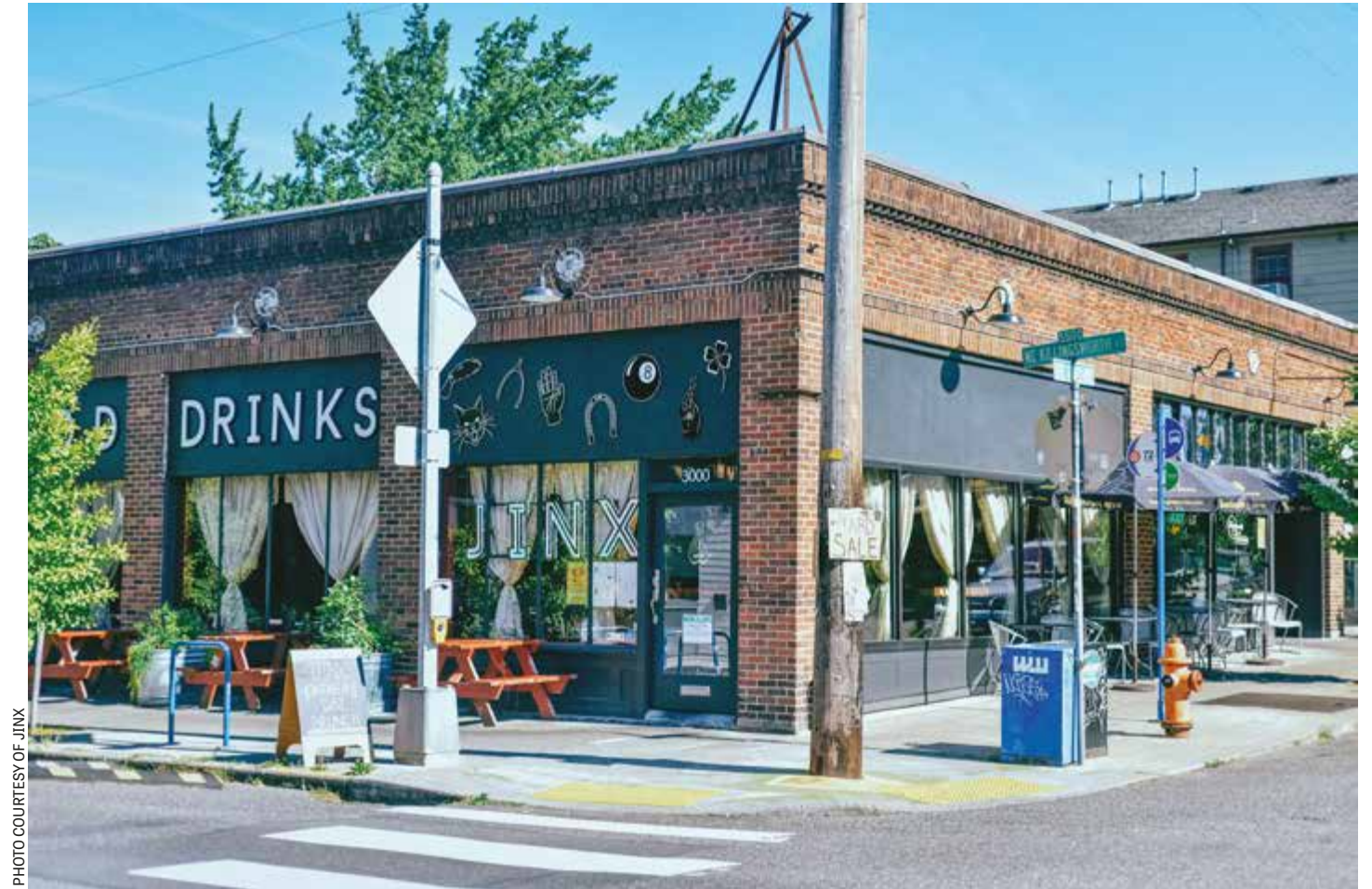
In lieu of serving paying customers inside Jinx, Courtney Hulbert-Lords and her staff have served 3,300 free meals.

The weeks in between are spent preparing free meal kits with almost-cooked and/or reheatable items. Holiday meals call for special treats. The Thanksgiving meals included hot chocolate.