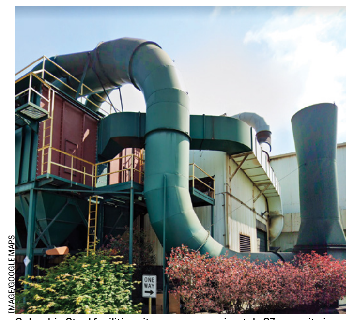
Columbia Steel facilities sits on an approximately 87 acre site in Northeast Portland.

shredder has prompted community outcry on the lack of air emissions data; local residents agitated at a public hearing in mid-December, and now the deadline for public comment has been extended to Monday, Feb. 8, 2021. Find out more about the process and the facility