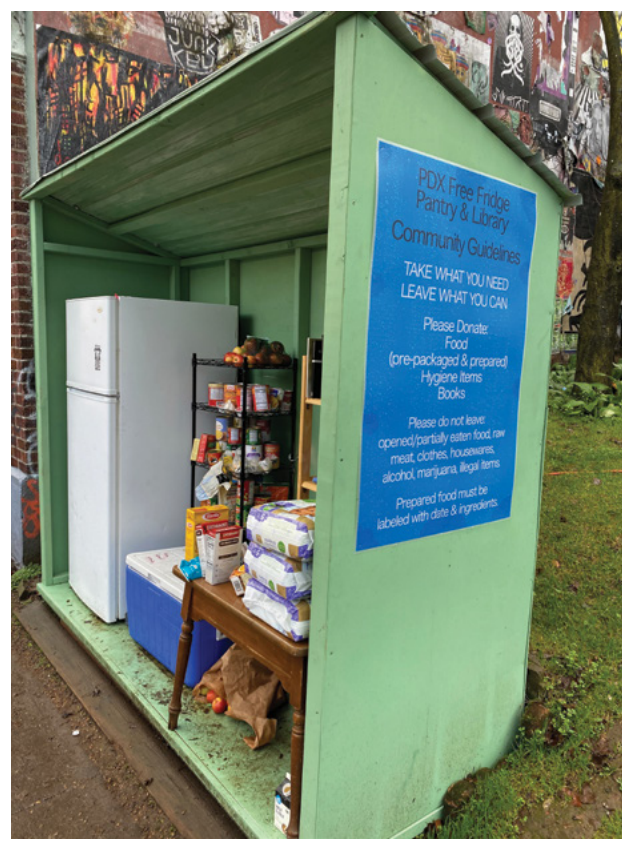
Portland Free Fridge