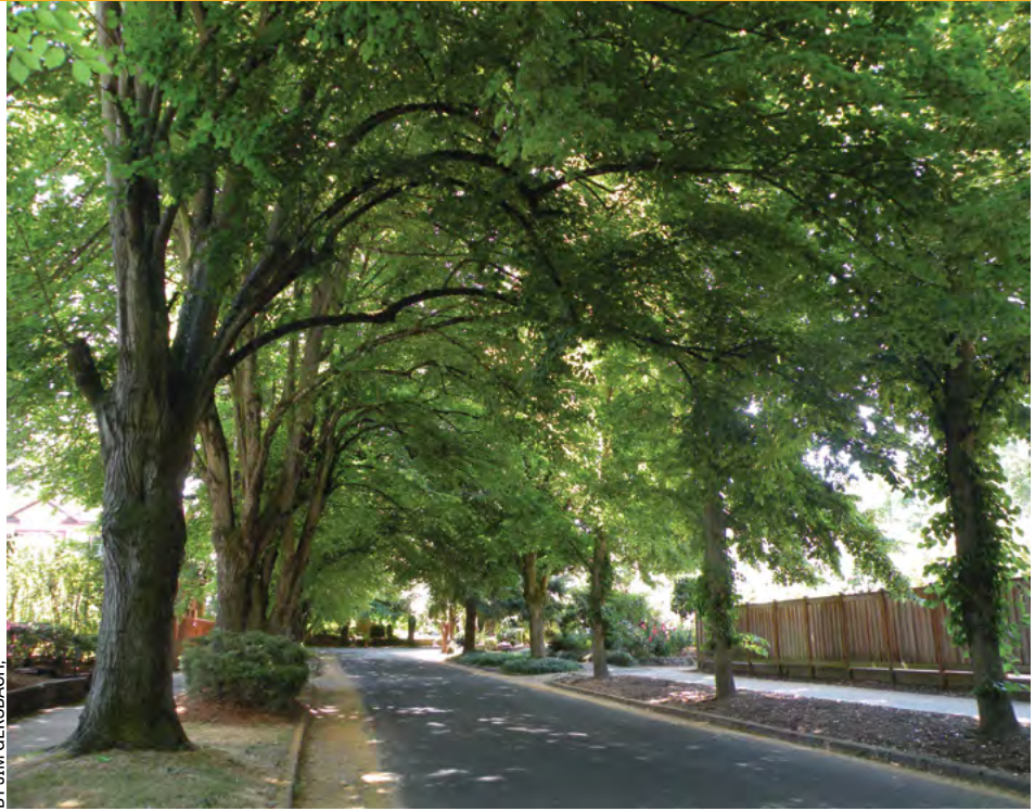
Littleleaf lindens, Ladd's Addition

Find more information about our work at www.treesforlifeoregon.org and sign up for updates to keep informed about how you can help our large trees.