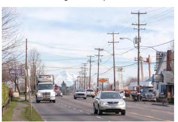
The North Edge of Portland, along the Columbia River, has the highest concentration of facilities under Cleaner Air Oregon evaluation anywhere in the entire state.

Oct. 26 meeting offers updates, review of air pollution tests and next steps