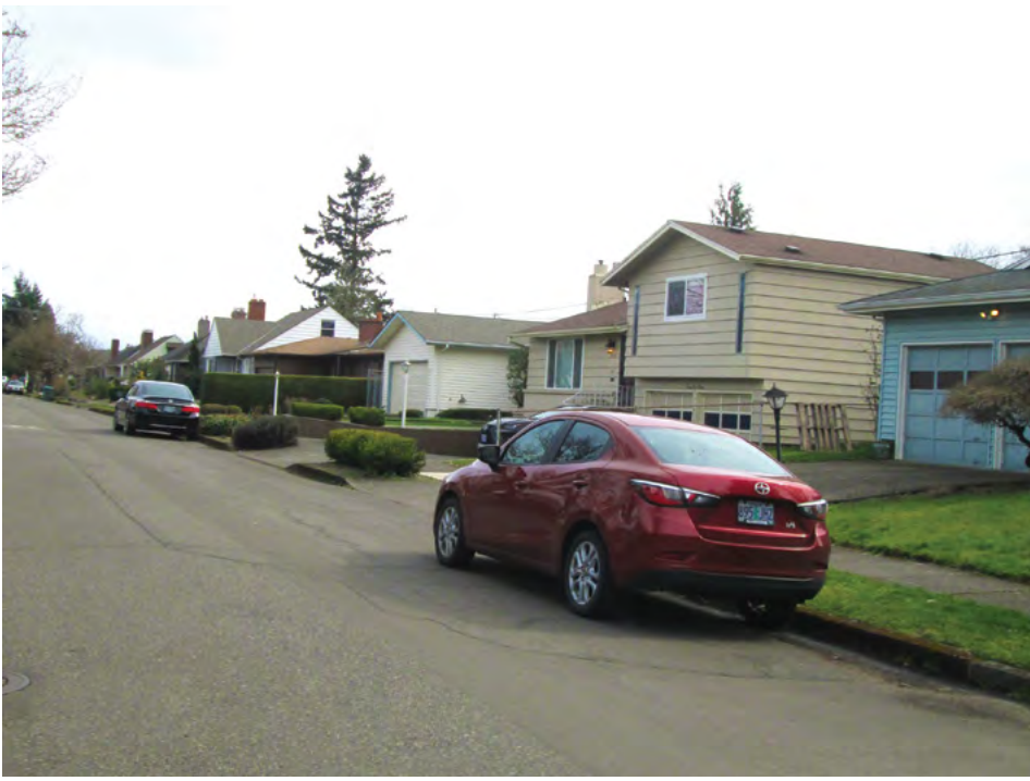
East of 82nd Ave., north of Division St.