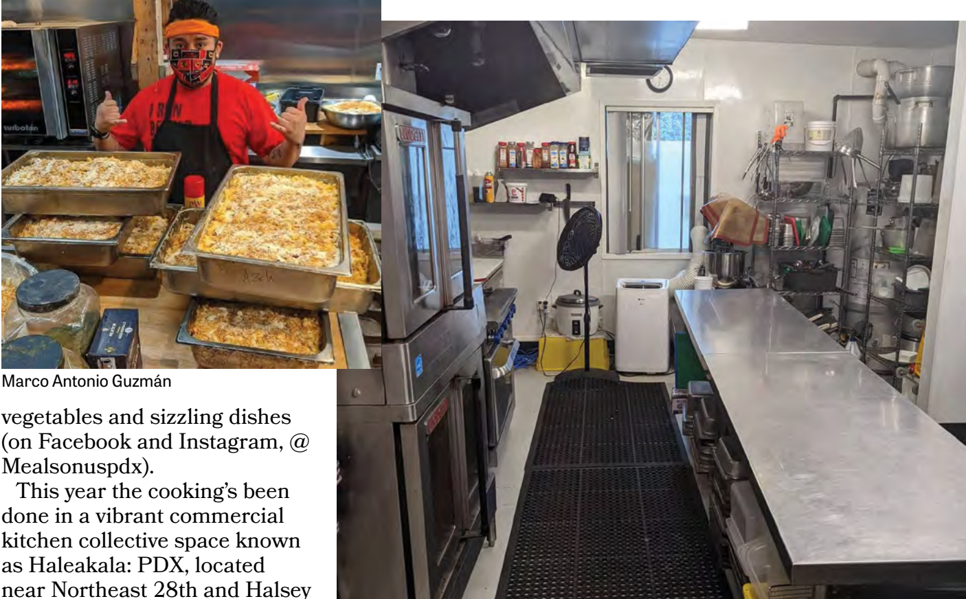
Meals On Us kitchen

cial kitchen, Haleakala: PDX is a social justice hub supporting nonprofit groups and communities with delicious freshcooked food.