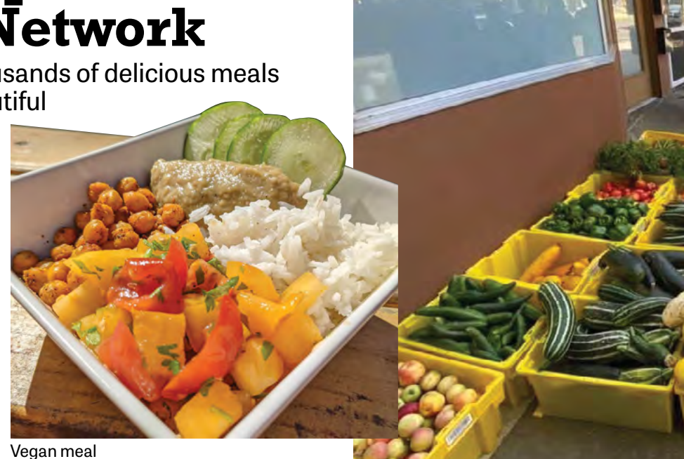
Meals On Us veggie crew

The group typically prepares breakfasts, lunches and dinners that get packed up by volunteers and delivered in bulk. That may sound dull, but Guzmán chronicles everything in gorgeous social media posts packed with photos and videos of fresh