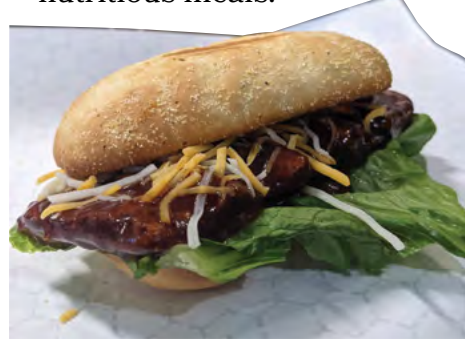
The not-McRib sandwich

They've racked up more than 7,000 miles delivering locally – but this past September, hundreds of food trays went all the way to the Klamath Tribal com-