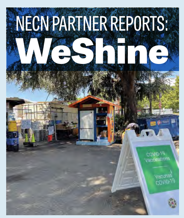
COVID vaccination outreach at Right To Dream Too

We want to start this issue by thanking all the friends, volunteers, and supporters who have helped us make such extraordinary progress in such a short period of time. A special thanks to all of you who were able to attend our Summer Garden Party, to the many who made generous contributions, even if you couldn't attend, and to the many volunteers who helped pull it off. We raised over $10,000 in pledges and donations that will underwrite WeShine's administrative costs for the remainder of 2021. Pledges included one for our shower unit at our first